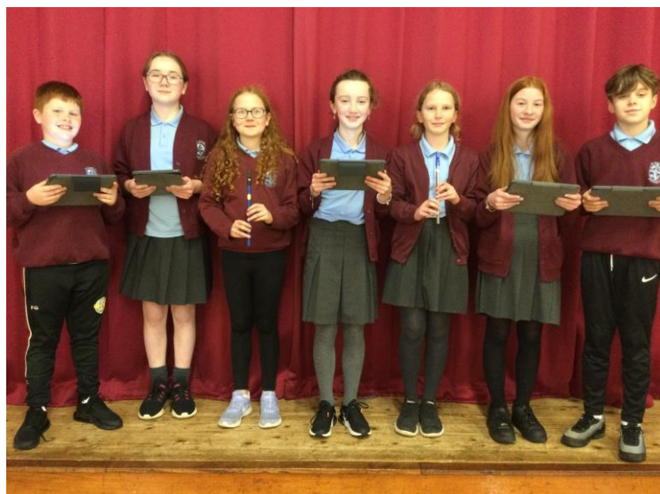
P7 Music & ICT Leaders