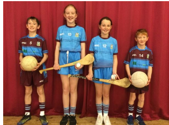
P7 Sports Captains