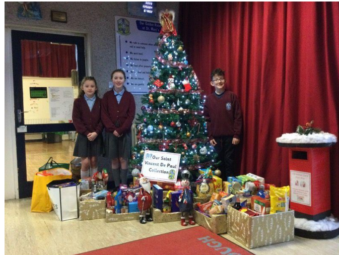
St Vincent De Paul Christmas Hampers