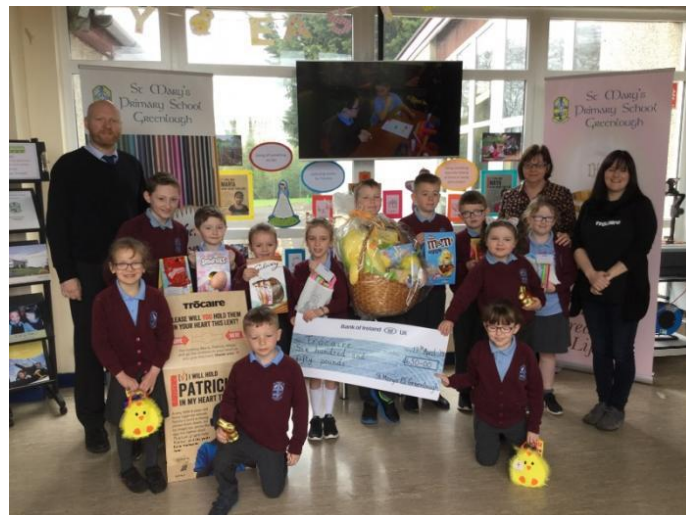
Money raised for Trocaire