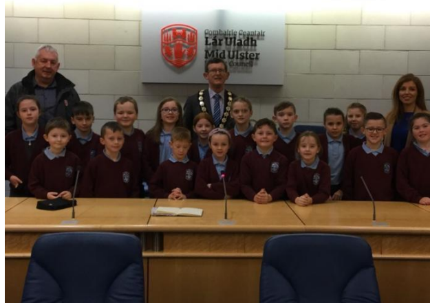
School & ECO Council visit to Magherafelt Council building